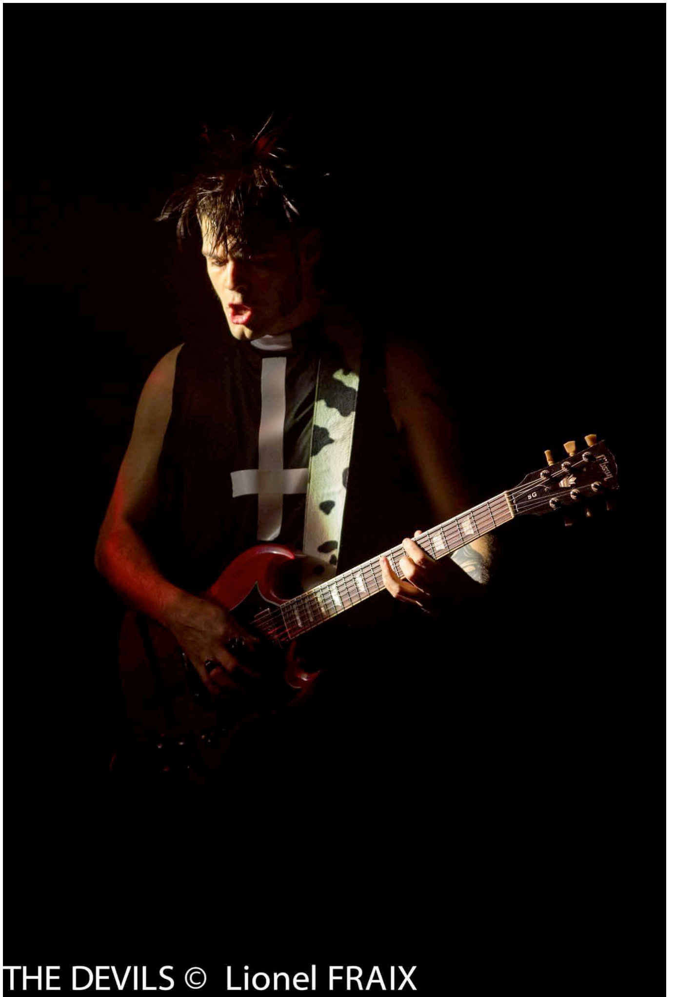
THE DEVILS