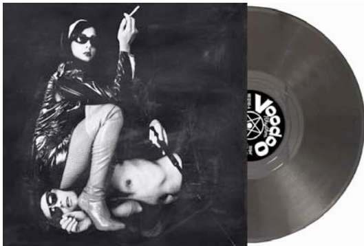
BAND: THE DEVILS ALBUM: IRON BUTT LABEL: VOODOO RHYTHM RECORDS - 2017 FORMAT: LP / LP+CD