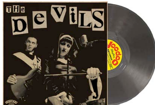
BAND: THE DEVILS ALBUM: SIN, YOU SINNERS! LABEL: VOODOO RHYTHM RECORDS - 2016 FORMAT: LP / LP+CD